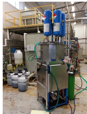
Figure 3. Preparation of nZVI suspension for the Spolchemie I site.

Although the first deployment of nanoremediation in the field took place as early as 2000, its rate of adoption has been slow compared for example with other ISCR/ISCO technologies over the subsequent 17 years. Over 100 field deployments have taken place worldwide, the majority of these have been field tests rather than practical commercial technology deployments. The work of NanoRem has included multiple, well documented, European field trial applications of various particles (see Table 2, page 3 and NanoRem Toolbox, page 4).