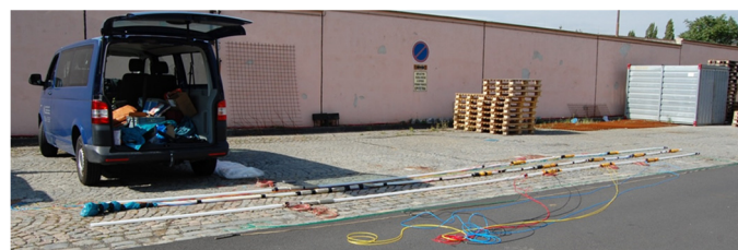
Figure 4. Preparation of the monitoring equipment at the Spolchemie I site.