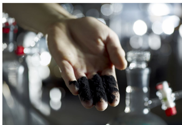
Figure 1. Air-stable Carbo-Iron® contains iron NPs sorbed to activated carbon.

Nanoremediation describes the use of nanoparticles (NPs) in the treatment of contaminated groundwater and soil. Depending on the properties of different particles, nanoremediation processes generally involve reduction, oxidation, sorption or their combination. NPs are usually defined as particles with one or more dimensions of less than 100 nm ( 1 \times 10^{-7} m). In practice, nanoremediation may apply to particles which are larger, for example composites, but which include activities at nanoscale dimensions. NPs used in remediation are mostly metals or metal oxides, most frequently nano-scale zerovalent iron (nZVI). They may be modified in various ways to improve their performance, for example inclusion of a catalyst (often palladium), use of coatings or modifiers, or emplacement on other materials such