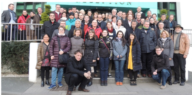
Figure 2. The NanoRem consortium.

appropriate use of nanotechnology in restoring land and water resources and the development of the knowledge based economy at a world leading level for the benefit of a wide range of users in the European Union environmental sector.