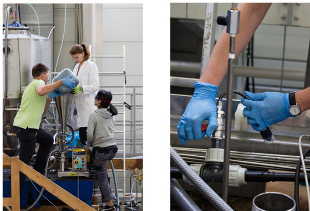
Figure 5. Left: Preparation of the NP suspension for injection into the large scale flume (LSF) at VEGAS. Right: Taking samples during the LSF experiment at VEGAS © VEGAS, University of Stuttgart, Germany.

As for any ISCR/ISCO technology, the appropriate use of nanoremediation requires: